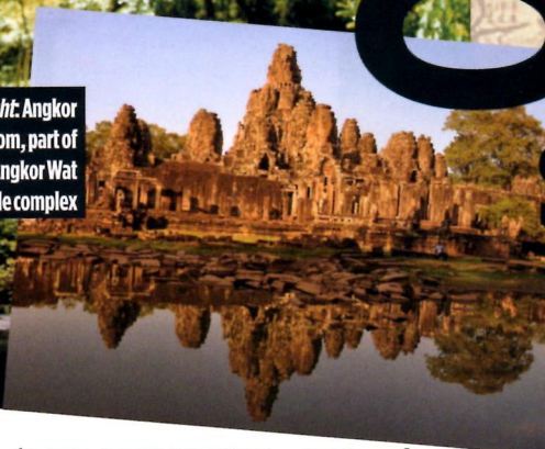
Right: Angkor Thom, part of the Angkor Wat temple complex