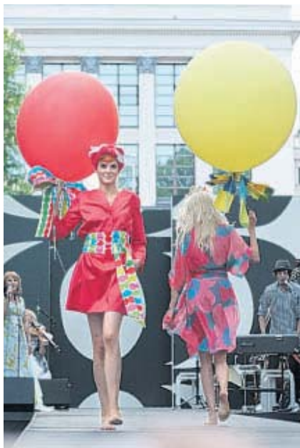
HELSINKI IMAGE LIBRARY