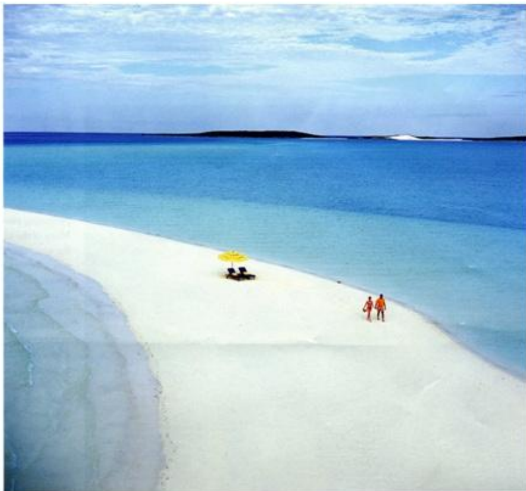
RIGHT: rush hour on the sand bar at Masha Cay, Bahamas. BELOW: the villa on the Greek island of Pegasus has been sensitively restored in the local style but with subtle updating