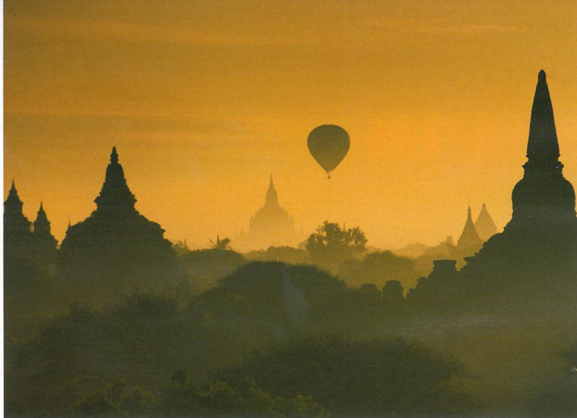
Above: Khiri Travel offers tours to Bagan and beyond in Burma. Below: The Nolitan hotel, New York.