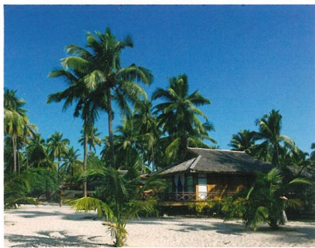
Above: Amara Ocean Resort at Ngapali Beach, Burma.