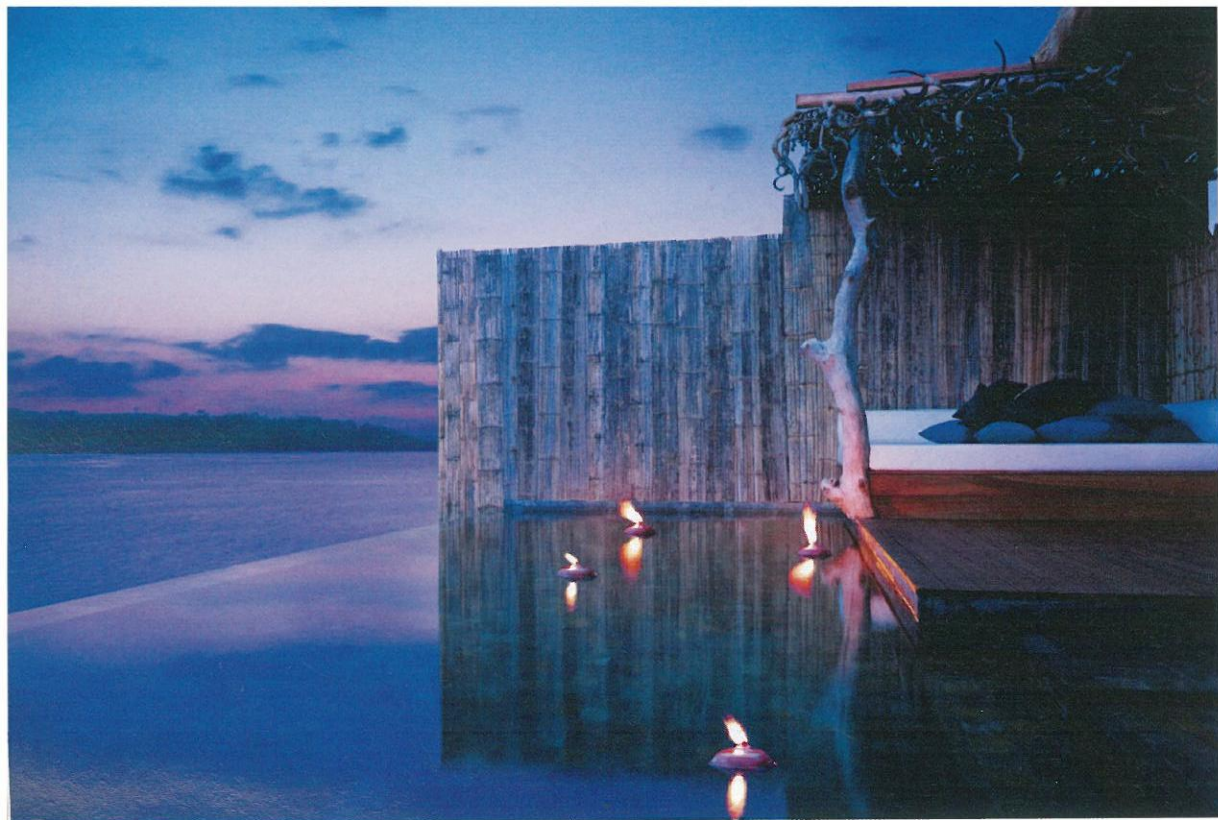
Above: an over-water villa at Song Saa resort, Cambodia. Below: the cruise-liner-like Hotel Lone in Rovinj, Croatia.