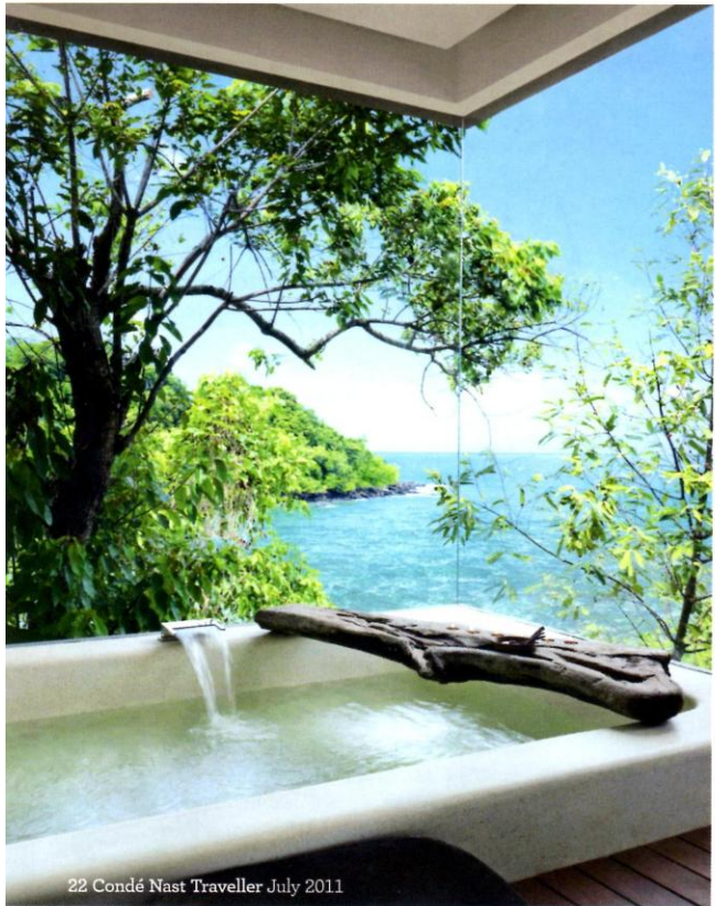
22 Condé Nast Traveller July 2011