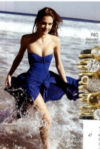
P56 Beach fashion