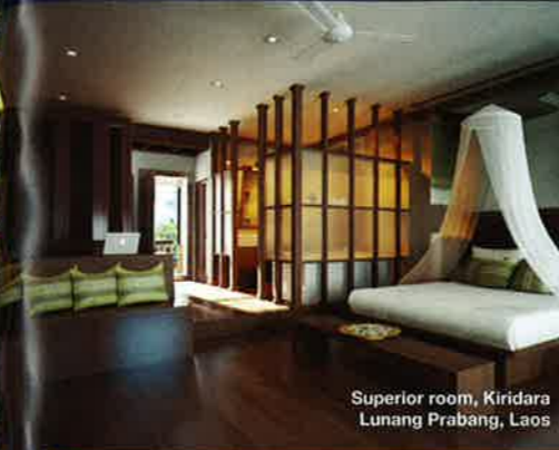
Superior room, Kiridara Luang Prabang, Laos