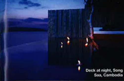
Deck at night, Song Saa, Cambodia