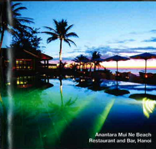
Anantara Mui Ne Beach Restaurant and Bar, Hanoi